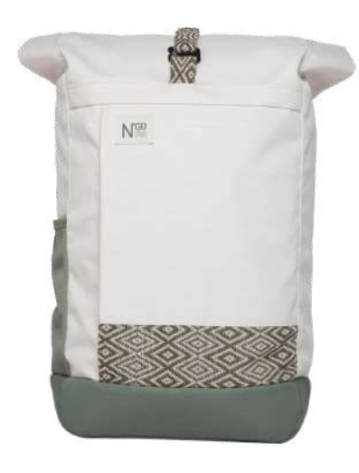
BANH MI Beige / Olive-green