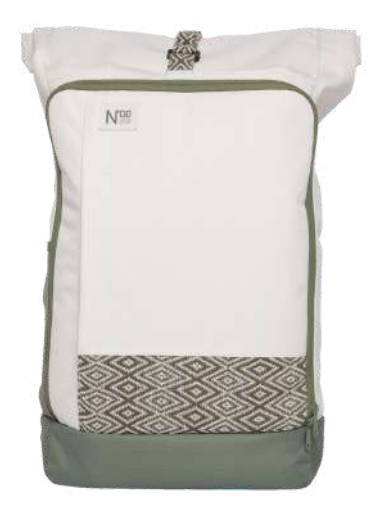
BUN CHA Beige / Olive-green