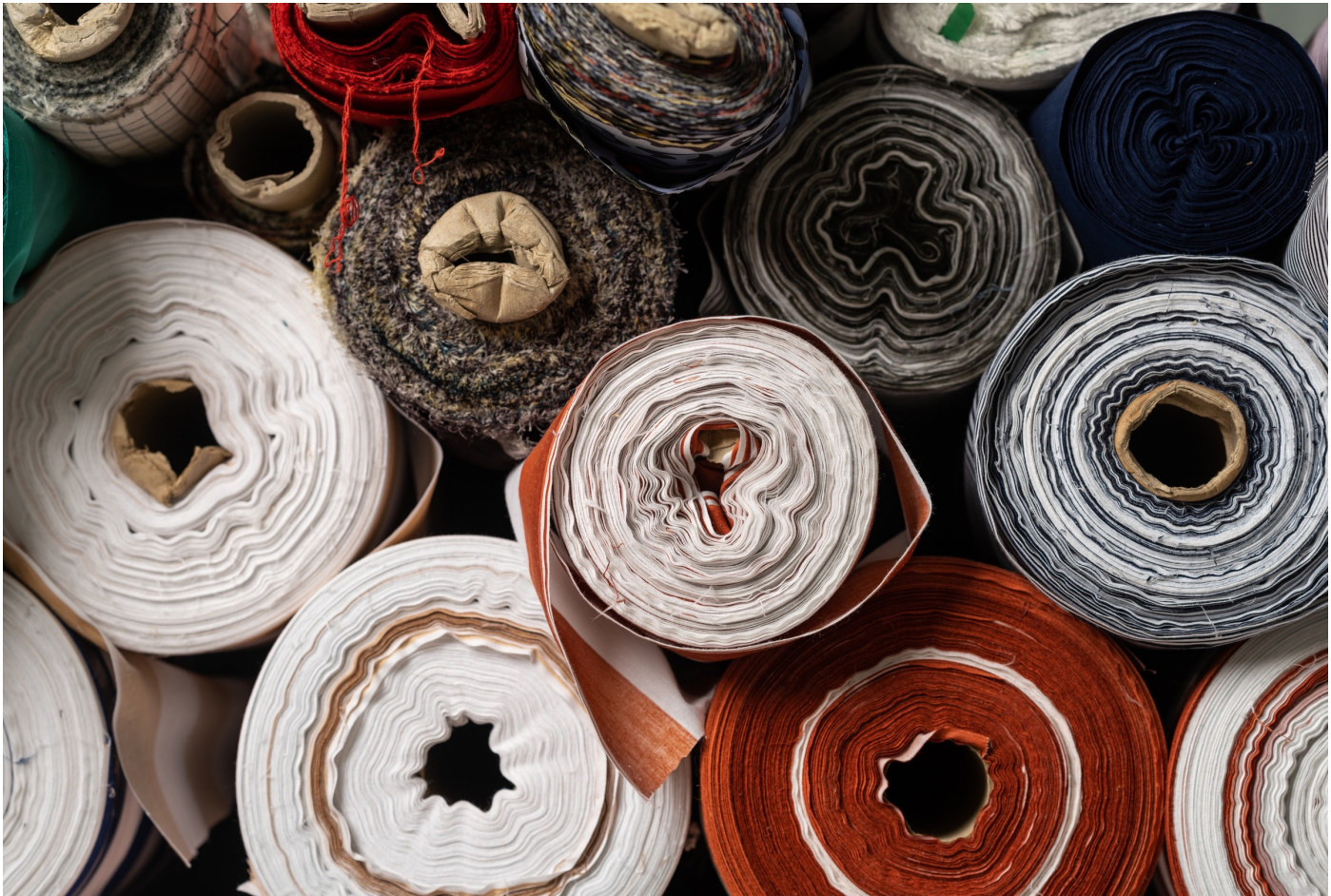
Upcycled Polycotton linings