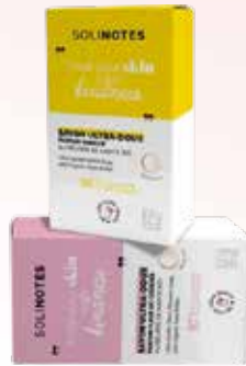
BAR SOAP FACE AND BODY