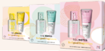
EAU DE PARFUM 50ML + HAND CREAM 30ML