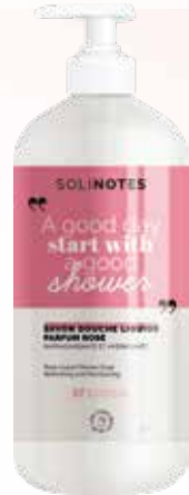
SHOWER SOAP FACE AND BODY