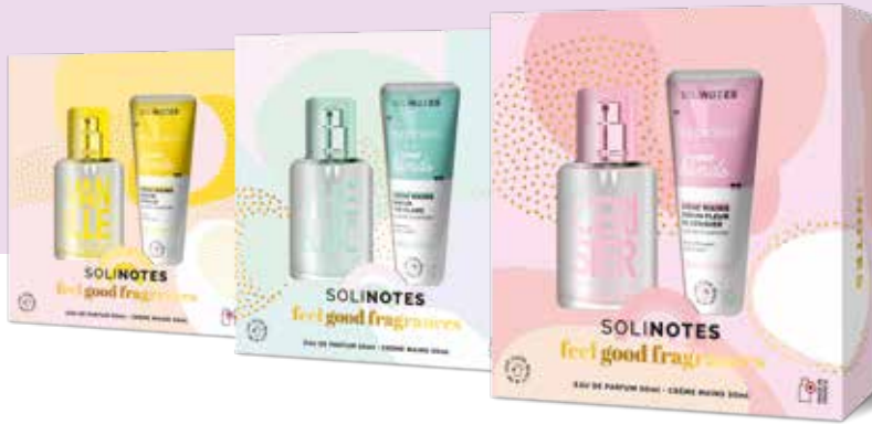
GIFT SET EAU DE PARFUM 50ML + HAND CREAM 30ML