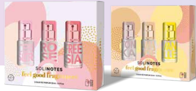
5 SIZES AND ASSORTMENTS

The Solinotes giftsets celebrate optimism and color harmony . Each box is adorned with a trendy graphic print and festive details . Eco designed boxes: 100% cardboard packaging, 0% plastic, and a sustainable sourcing