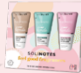
HAND CREAM TRIO GIFT SET 3x30ML