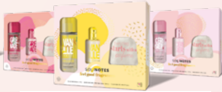
EAU DE PARFUM 50ML + BODY MIST 250ML + FREE POUCH GIFT SET