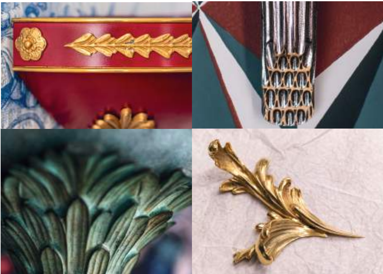
Finish : Antique decor – 24K gold gilding – Nickel – Bronze medal – and other custom decor.