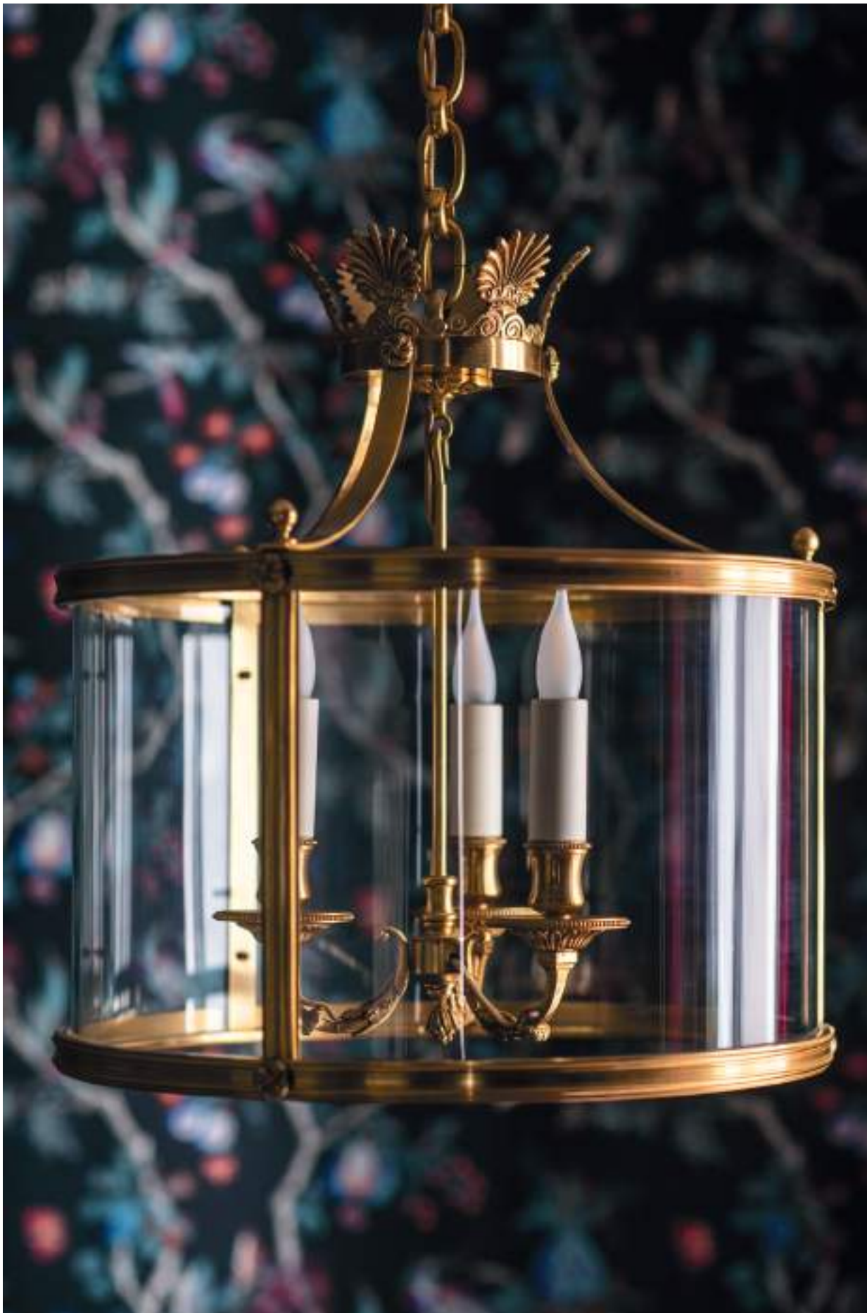
Ref - 30745 - Lantern Tambourin H : 40 cm Ø : 38 cm Number of arms : 3 Gilded 24K