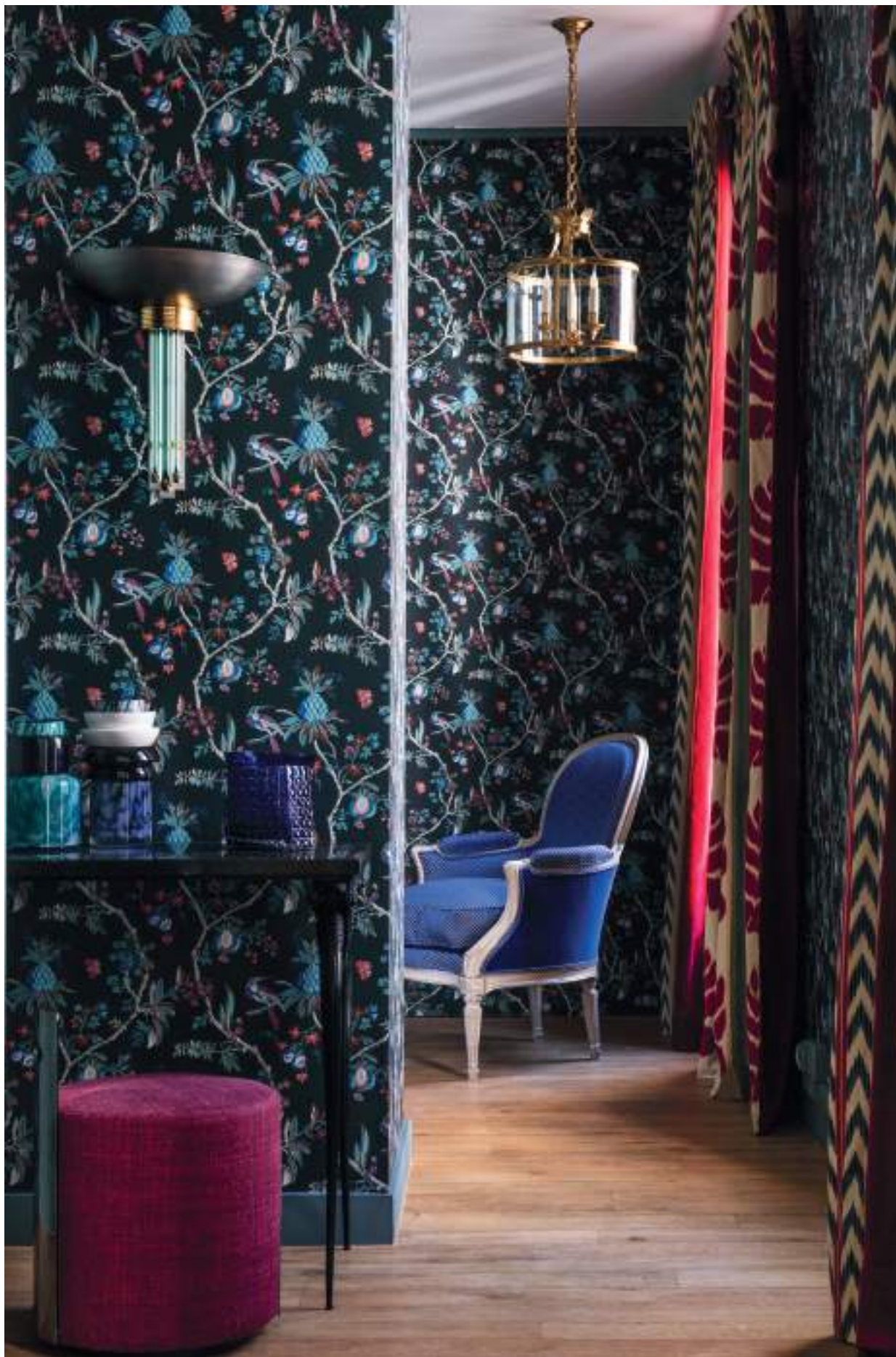
Ref - 30745 - Lantern Tambourin H : 40 cm Ø : 38 cm Number of arms : 3 Gilded 24K