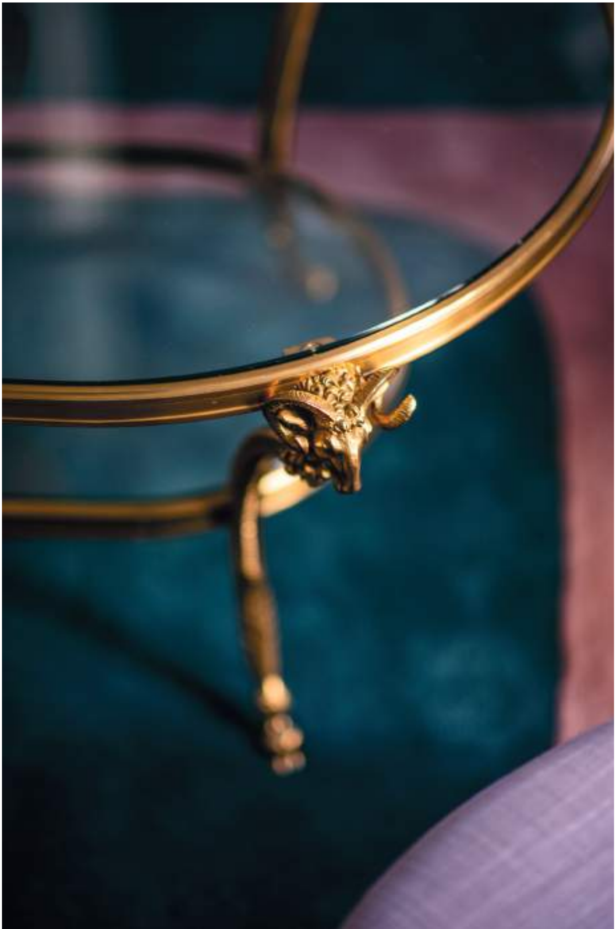
Ref - 43605 - Low table Béliers H : 45 cm L : 120 cm Larg. : 65 cm Gilded 24K