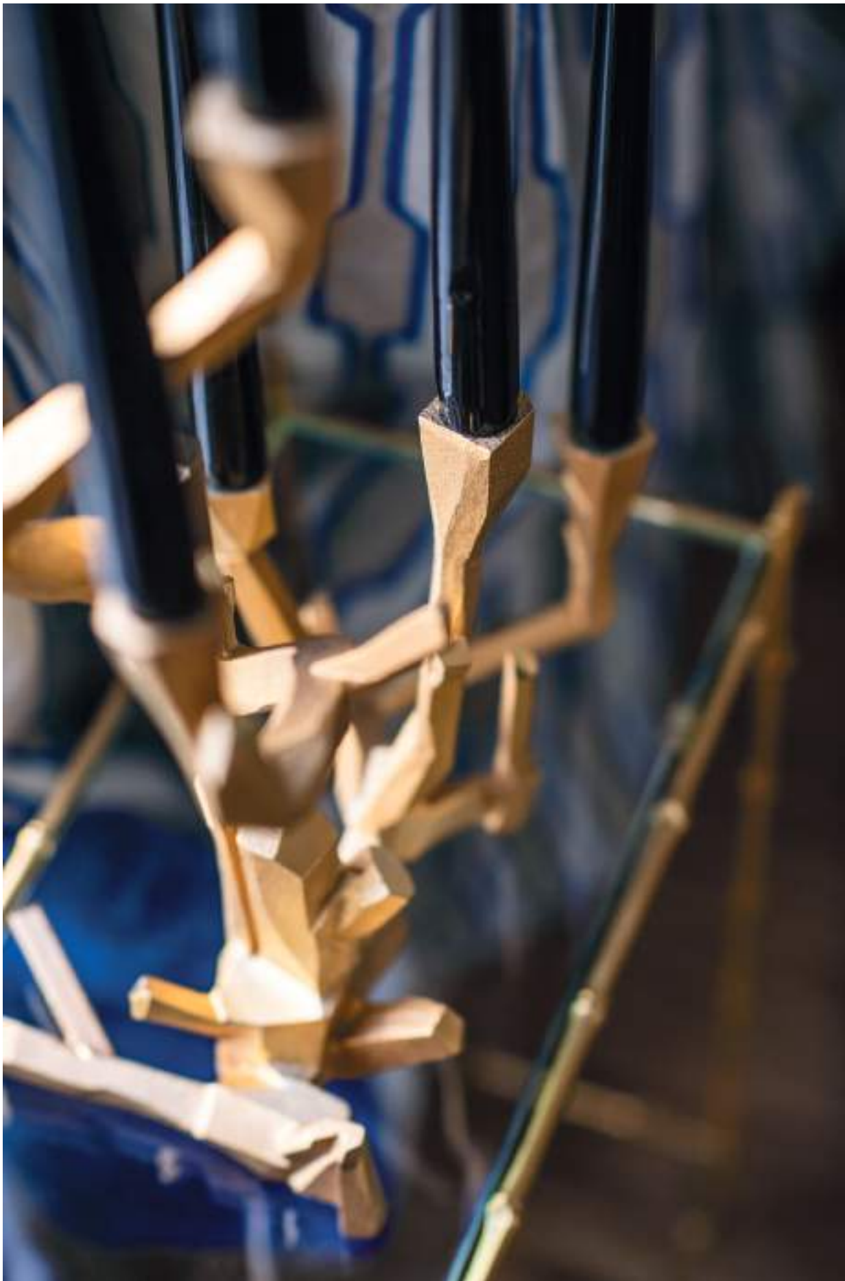
Ref - 125 - Candlestick Corail H : 42 cm Larg. : 28 cm Number of arms : 5 Gilded 24K