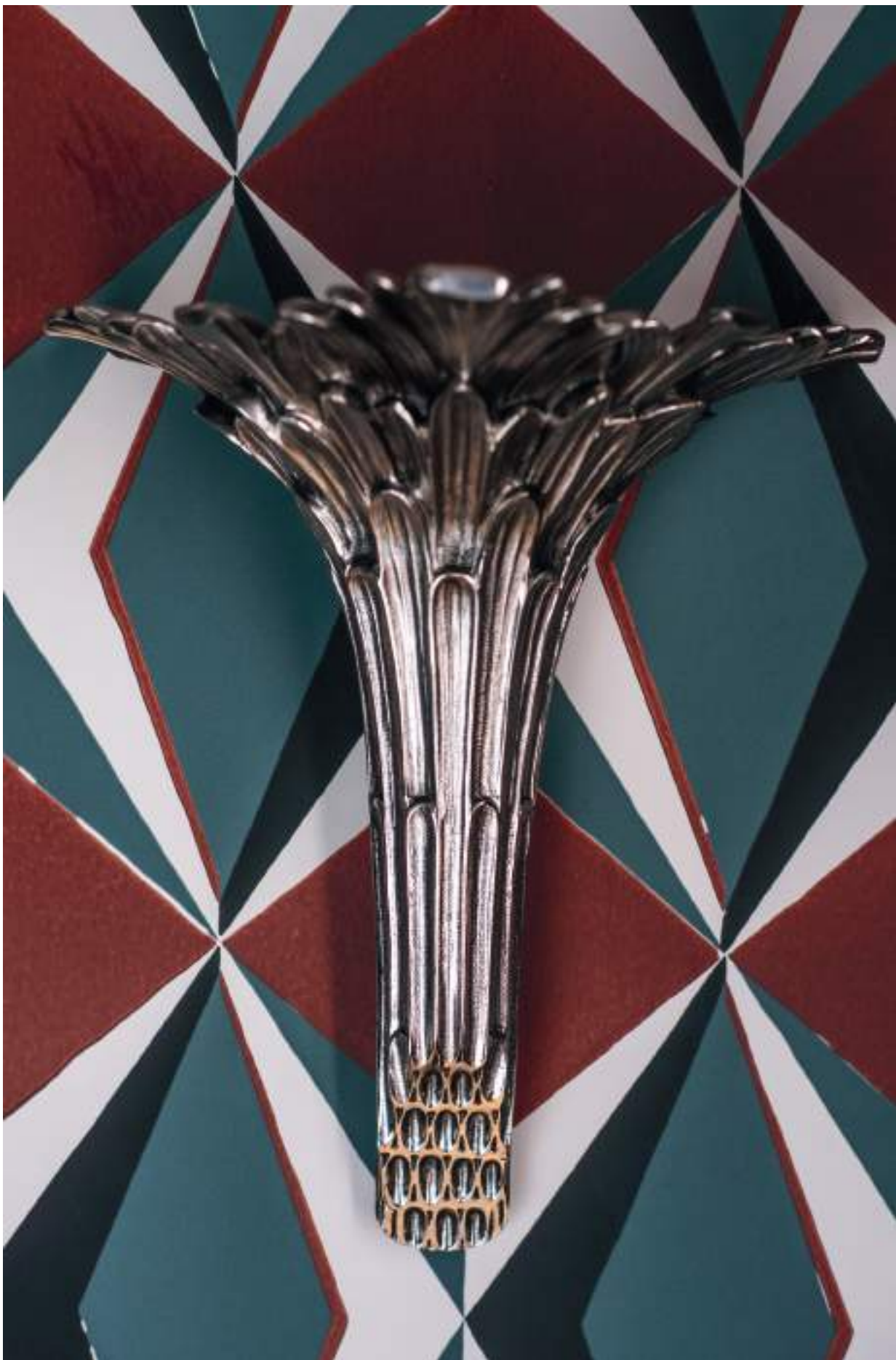
Ref - 24639 - Wall light Palme H : 32 cm Larg. : 28 cm 1 light Bright Nickel finish