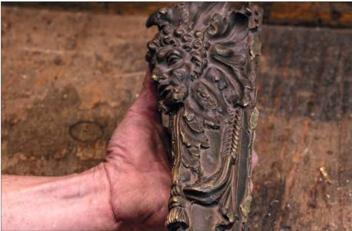
Restoration of bronze lighting and furniture : Re-electrification to standards and creation of missing parts – Crystals.