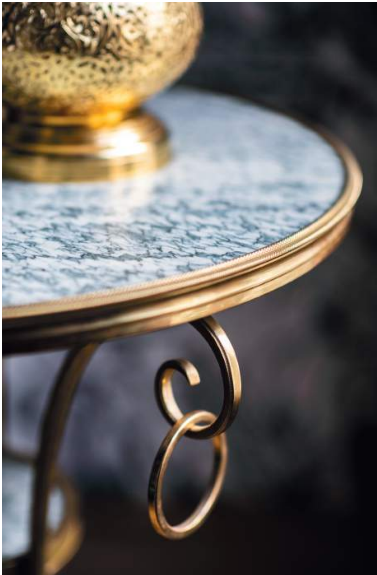
Ref - 41990 - Side table Anneaux H : 69 cm Larg. : 60 cm Gilded 24K et Arabecato crochia marble