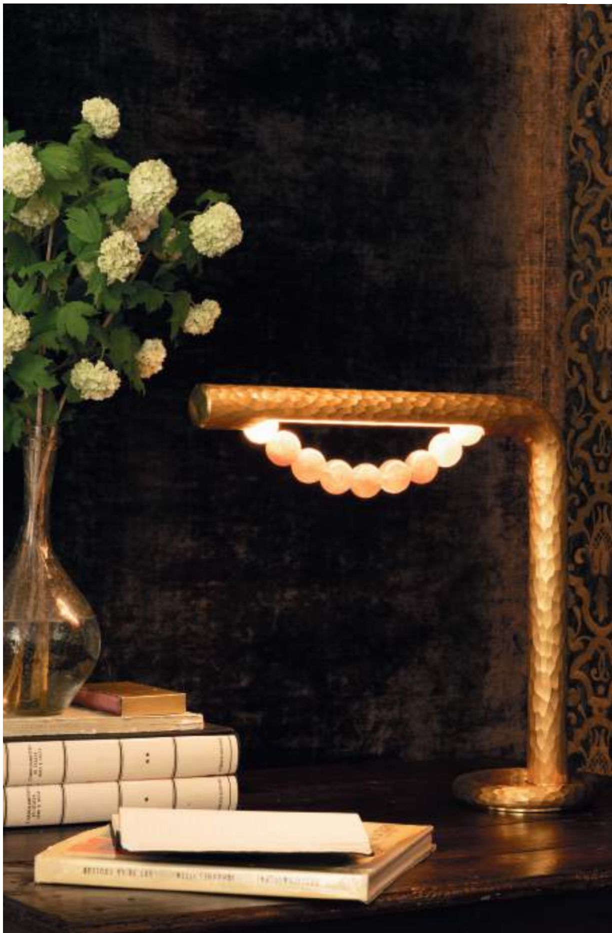
Ref - 176 - Lamp FOREVER H : 45 cm L : 38 cm Ø : 22,5 cm LEDs lights Gilded 24K and pink quartz