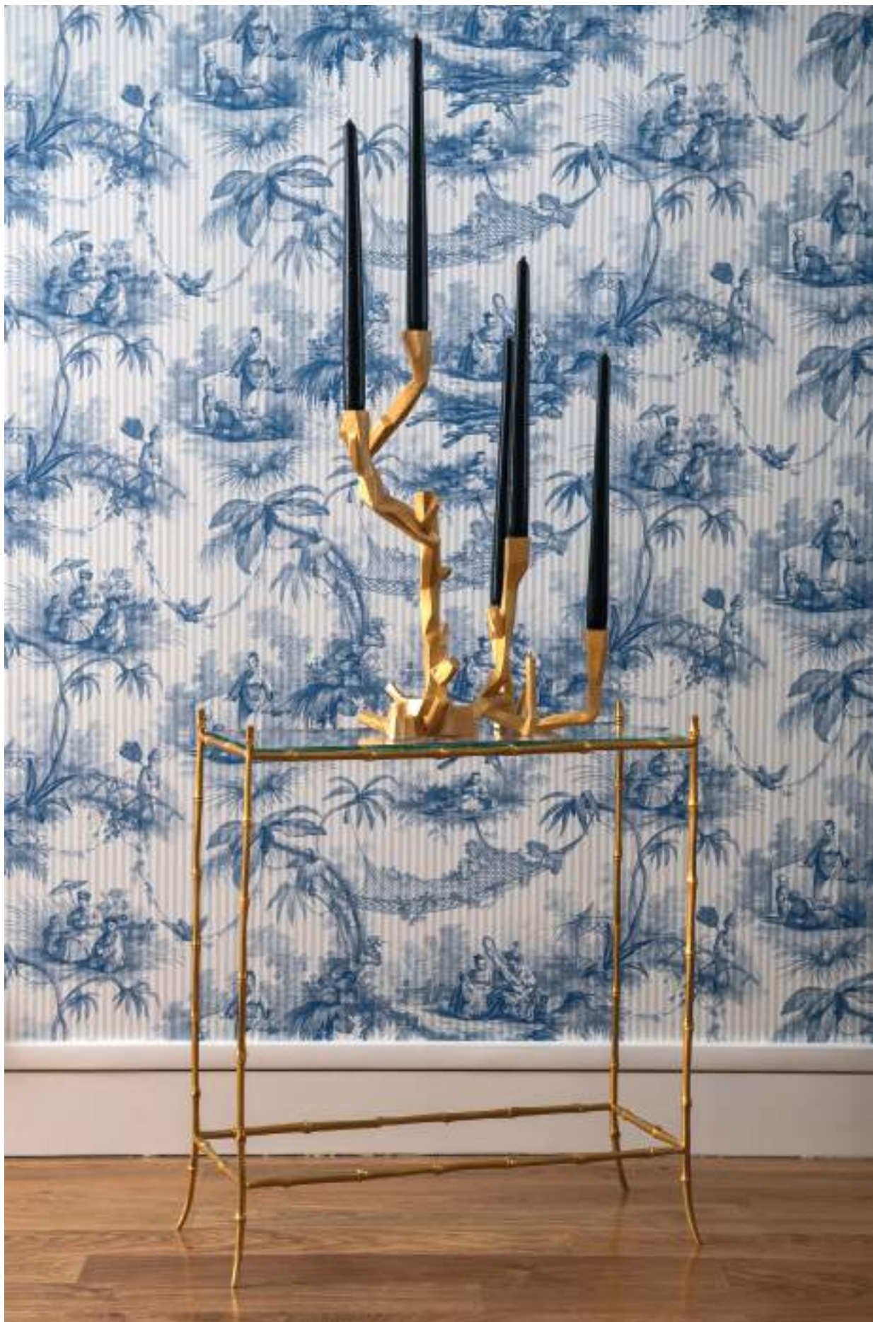
Ref - 44541 - Side table H : 56 cm L : 49 cm Larg. : 20 cm Gilded 24K and glass