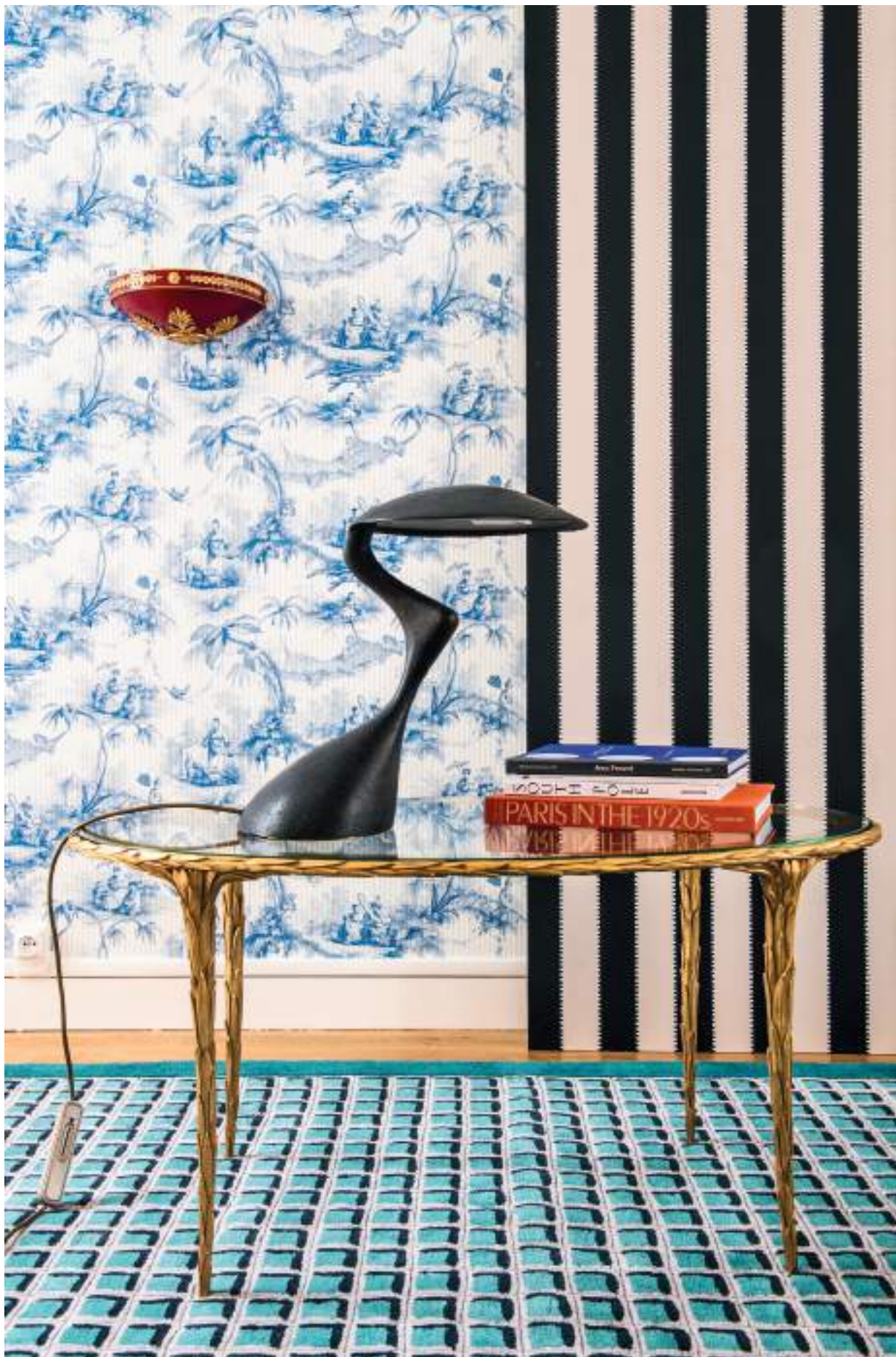
Ref - 21905 - Wall light half bowl Empire H : 11 cm Larg. : 30 cm Depth 15 cm 1 light Gilded 24K