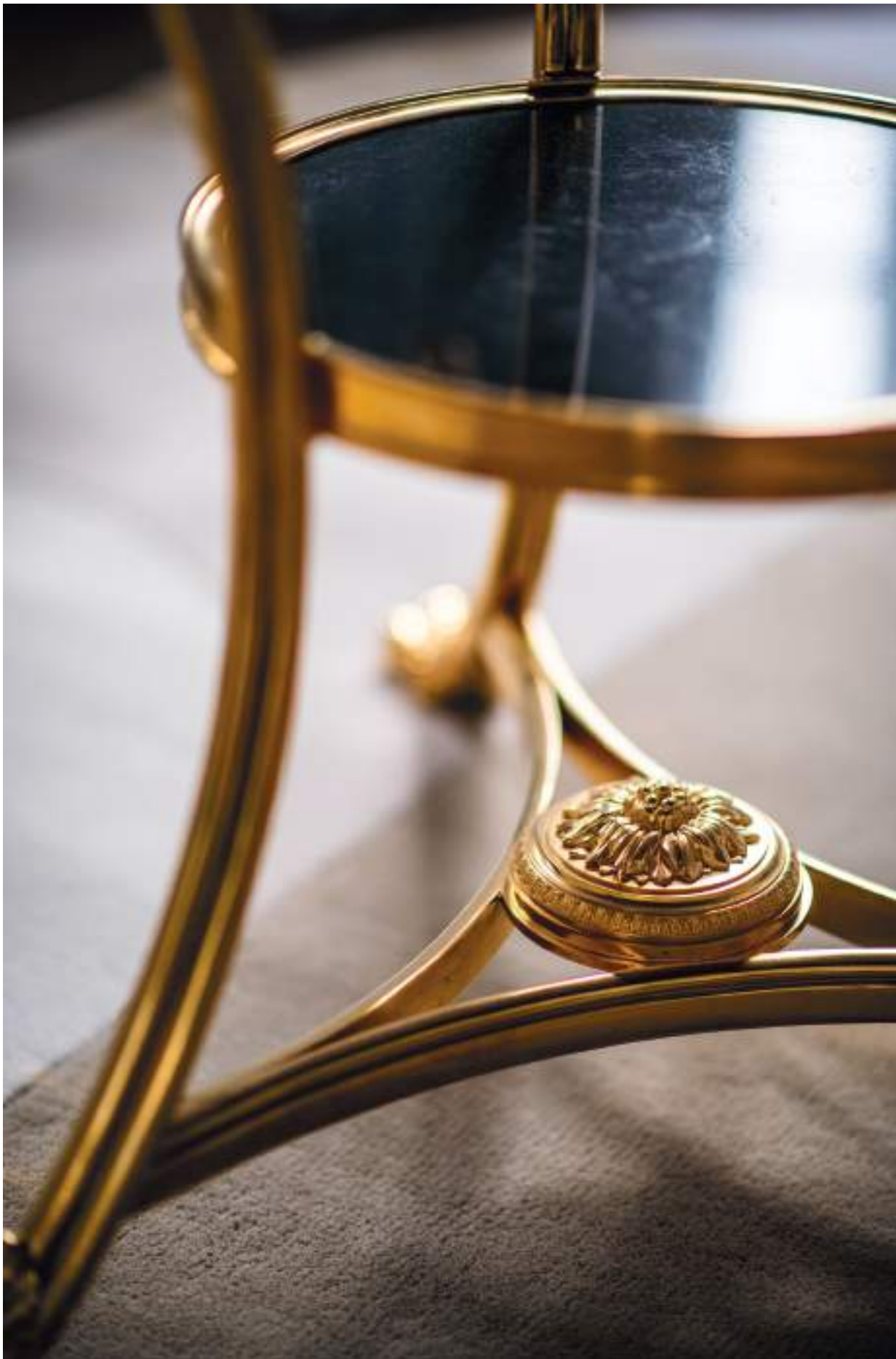
Ref - 41600 - Side table Trianon H : 75 cm Ø : 100 cm Gilded 24K and Black granite marble